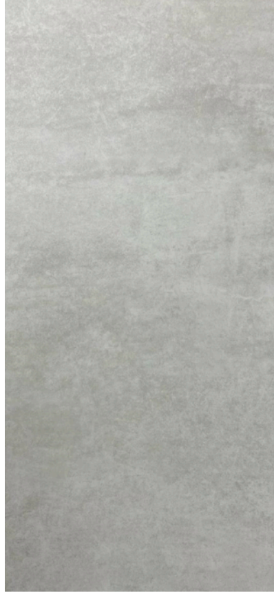
SPC MOD GUIMAR