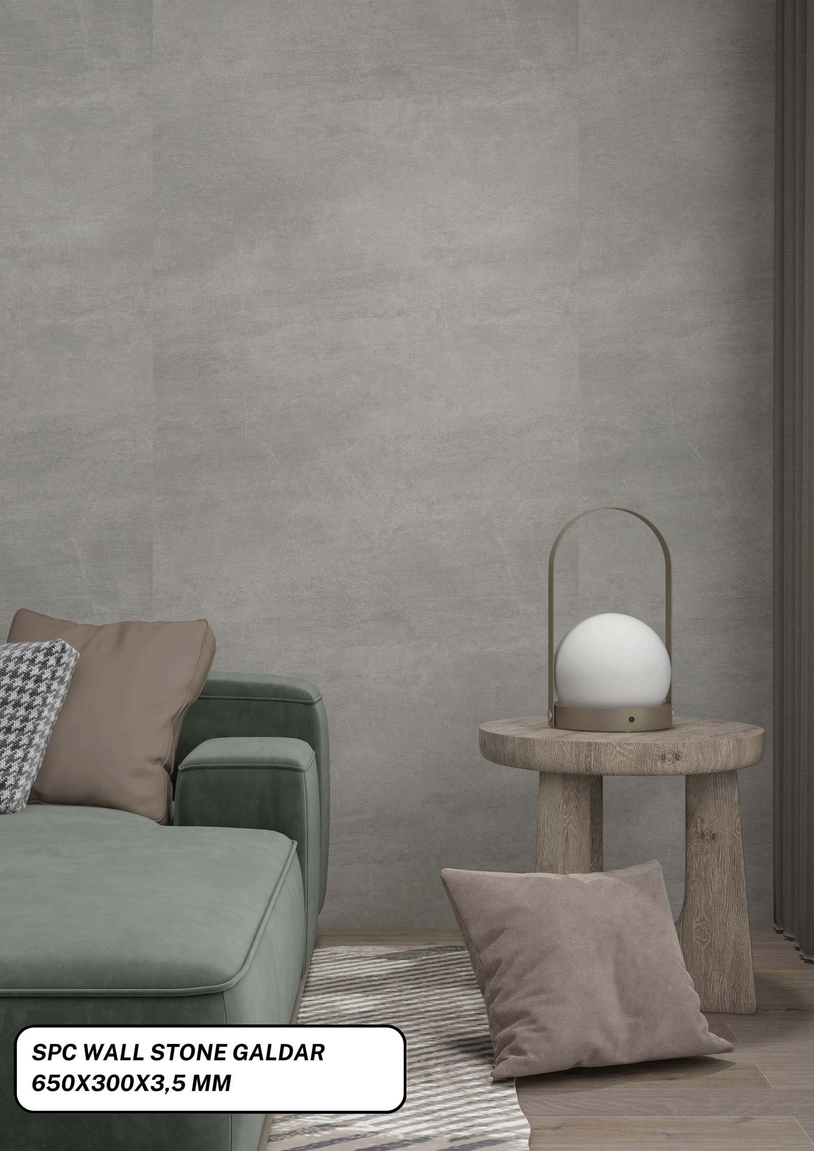
SPC WALL STONE GALDAR 650X300X3,5 MM