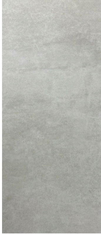
SPC MOD GUIMAR