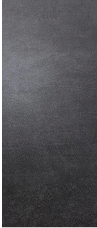
SPC MOD TMANFAYA