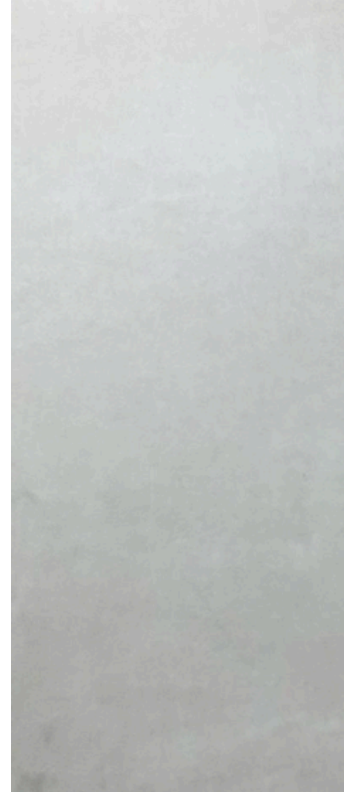
SPC MOD TUINEJE