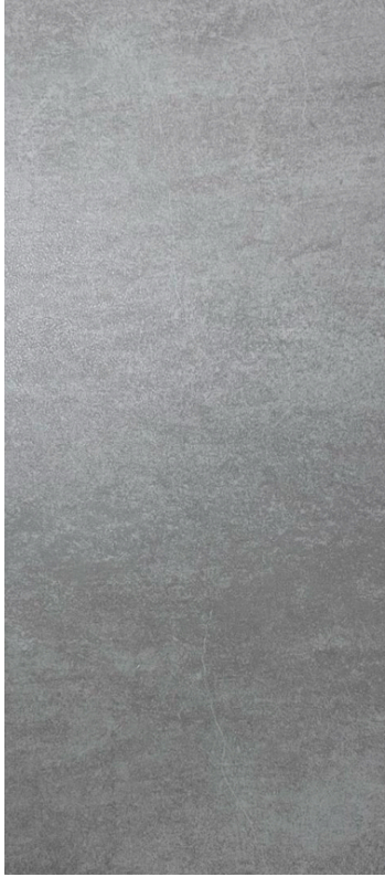
SPC MOD GALDAR